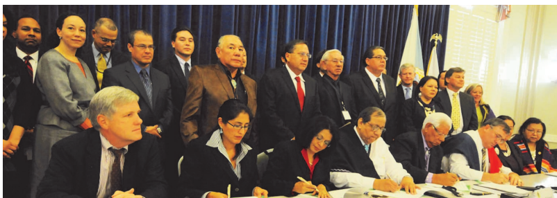
Federal officials and Tribal leaders commemorate the final settlement of historic trust accounting and trust management claims.

The Division also defends claims brought by tribes. Under settlements reached in the spring of 2012, the United States will pay a total of more than $1 billion to 41 tribes in compensation of the tribes’ claims regarding the government’s management of trust funds and non-monetary trust resources. And in October 2011, the Osage Tribe and the United States agreed to a historic settlement of the tribe’s claims for $380 million.