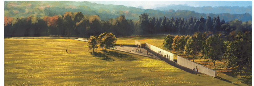
Flight 93 Memorial Design Plan