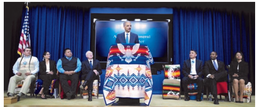
Attorney General Eric Holder announces the settlement of breach-of-trust lawsuits filed by more than 40 federally recognized American Indian tribes against the United States.

responsibilities include cases in virtually every United States district court of the Nation, its territories and possessions, the United States Court of Federal Claims, and in state courts. The subject matter involves federal land, resource and ecosystem management decisions challenged under a wide variety of federal environmental statutes and affecting more than a half-billion acres of lands managed by the Departments of the Interior and Agriculture (totaling nearly one-quarter of the entire land mass of the United States) and an additional 300 million acres of subsurface mineral interests; vital national security programs involving military preparedness and border protection, nuclear materials management, and weapons system research; billions of dollars in constitutional claims of Fifth Amendment takings covering a broad spectrum of federal activities affecting private property; challenges brought by individual Native Americans and Indian tribes relating to the United States' trust responsibility; a panoply of cultural resource matters including cases related to historic buildings, repatriation of ancient human remains and salvage of shipwrecks; preserving federal water rights and prosecuting water rights adjudications; ensuring proper mineral royalty payments to the Treasury; and litigation involving offshore boundary disputes, interstate water