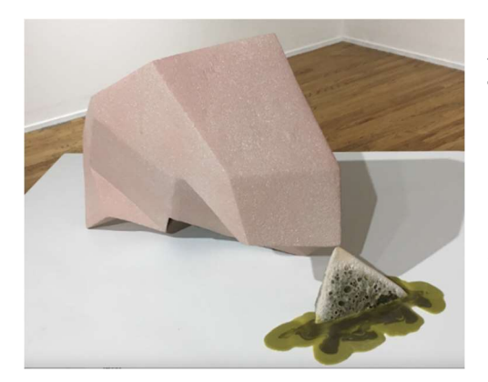
ART4921C-04- Intermediate/Advanced Ceramics T/R 9:00-11:30am, Adjunct Professor Marnie Bettridge Focus Area: Ceramics

We will utilize acrylic paint in depth to experiment with various contemporary techniques such as photo transfer with acrylic medium, using printed fabric and paper, dealing with objects, text-based work, mask making, and work without traditional canvas and stretcher bars. We will look at diverse approaches to creating contemporary paintings in the 21<sup>st</sup> century and discuss how we engage by looking and making.